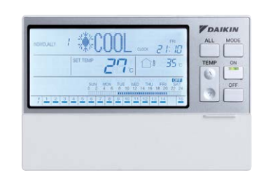
MODEL NO: DCS303A51